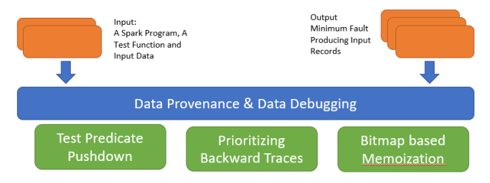
Figure 1: BigSifts Overall Architecture

analyze. To address this issue, Delta Debugging is a commonly used algorithm that executes the same program with different subsets of input records. However, applying Delta Debugging in a straightforward manner to big data analytics is not feasible as it is a generic, black-box approach that does not take into account the key-value mapping created by individual dataflow operators.BigSift is a tool we created to help identify the root cause of failures in DISC (Data-Intensive Scalable Computing) workflows with high precision. By combining delta debugging (DD) with data provenance and implementing a unique set of system optimizations geared towards repetitive DISC debugging workloads, we have brought DD closer to reality in DISC environments. Our approach involves redefining data provenance for debugging purposes by leveraging the semantics of data transformation operators. BigSift prunes out input records that are irrelevant to the given faulty output records, reducing the initial scope of failure-inducing records before applying DD. We have also developed a set of optimization and prioritization techniques that specifically benefit the iterative nature of DD workloads. Although our current implementation targets Apache Spark, our approach can be adapted to any data processing system that supports data provenance.