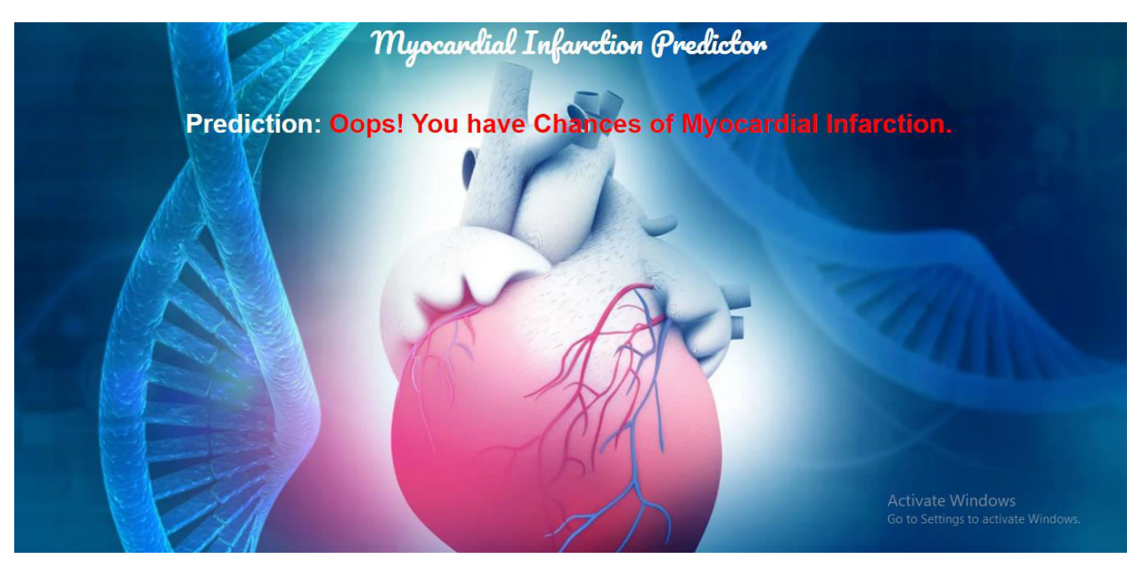
Fig 4.3 Result page 2