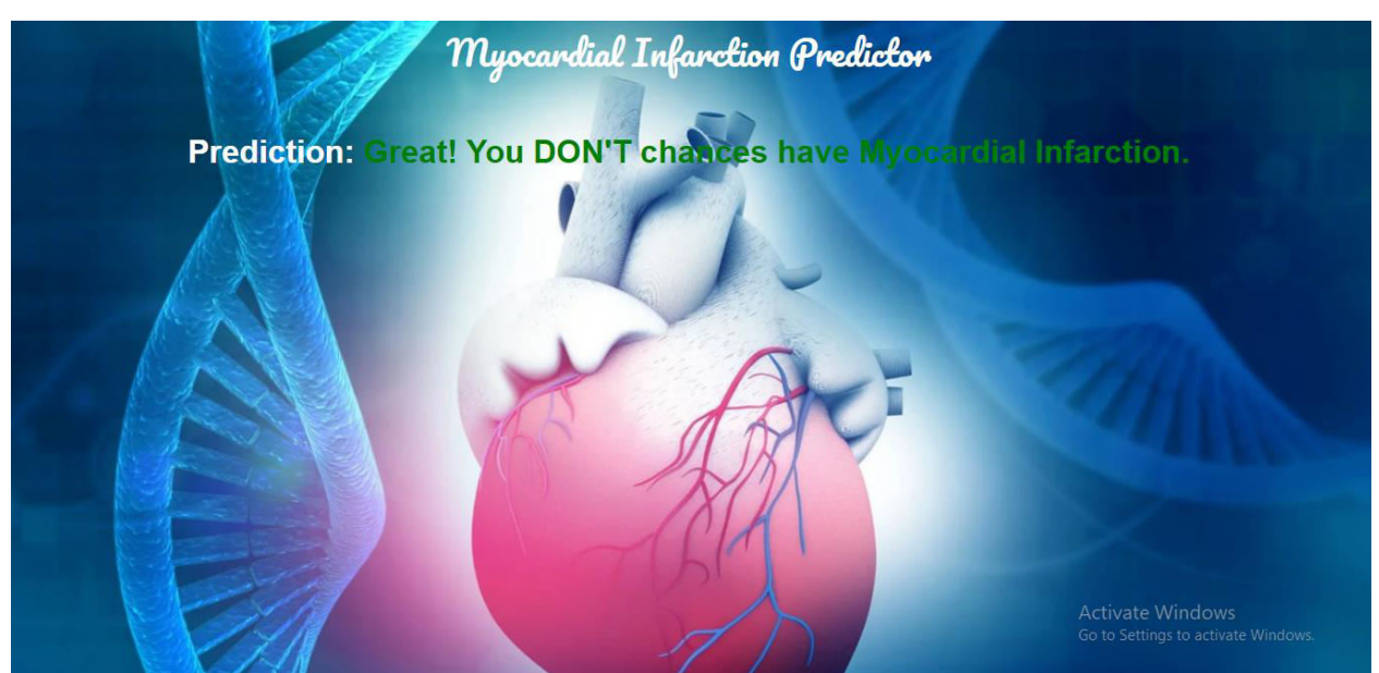
Fig 4.2 Result page 1

Organized by Department of CSE, Velammal Engineering College, Chennnai, India