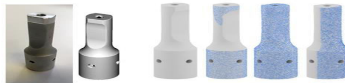
Figure 4.1: Real sonotrode (a1) scanned to get point clouds that have been post-treated (a2). CAD model of a sonotrode (b1) virtually reverse engineered following three parameterizations of the proposed framework (b2-b4).

Understanding the numerous curios that can arise during a genuine figuring out meeting is urgent for delivering sensible as-checked point mists. Truly ancient rarities can be brought about by pretty much confounded peculiarities that emerge from, and additionally between, the obtaining gadget (for example type, control boundaries), the digitalized object (for example material, variety, shape, and size), the administrator (for example securing procedure, experience), and the climate (for example light, temperature, vibration). Despite the fact that there might be different causes, there are five essential classifications in which the consequences for the subsequent point mists can be ordered (Fig. 4.2): non-uniform examining, missing information, skewed point mists, uproarious information, and exceptions.