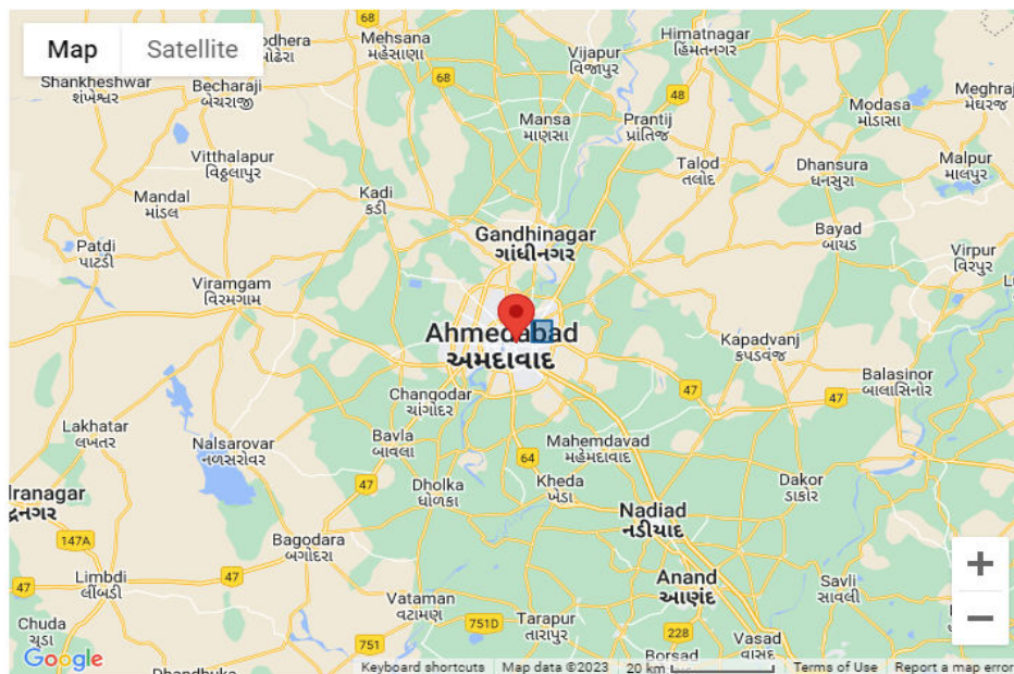
Fig. 2 Selected site location for analysis

In this process we have to first realise how much capacity required as a target for any particular state as we can see from the above table the latest targets of solar roof top capacity so as an example we have taken a site of Gujarat and for the base calculation we have taken 100 KW capacity and by using a solar PV watt calculator we have calculated the units generated. As the units generation of a 100 KW capacity plants of a year is available for calculation. We can find out the other financial calculations by the units per KW cost and central financial assistance provided by the central government an approximate calculation has been done and as per this base calculation we can go for the bigger units plants calculation for example 10 Megawatts we have done in this work. Taken the tariff rates as an average rates we can take the particular tariff rates of any states for which we want to calculate the technical details of units generated, financial cost of the units installed and after subsidies as well as payback period.