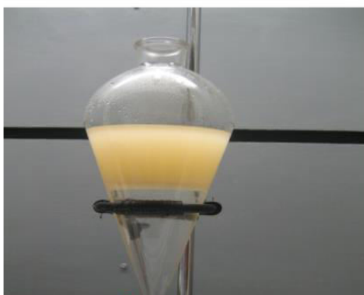
Figure 2. Biodiesel Extractions (Lower Portion)

The lipid from the sludge was extracted by Folch method of extraction of lipids in laboratory. The optimized sludge was added with chloroform-ethanol (2:1) and is filtered by funnel in the apparatus. The biodiesel was extracted by phase separation process in the bottom phase as shown in figure 2.