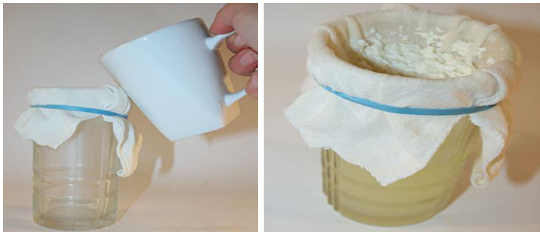
Fig:1 Identification of Total Solids (TS)