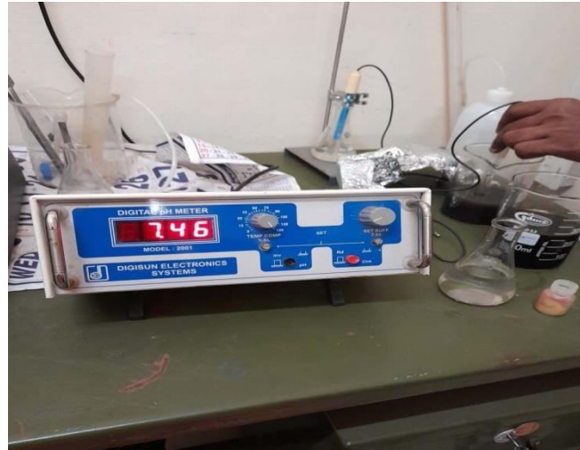
Fig.3.3 pH meter