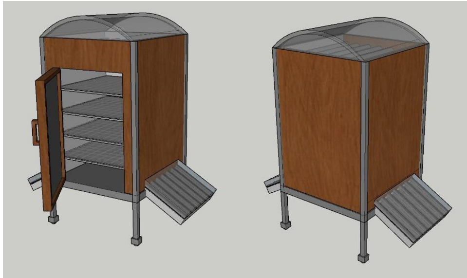
Fig 1: 3D view of portable solar dryer