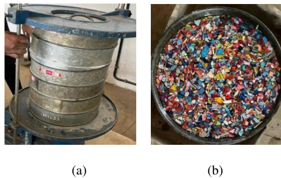
Fig.3 showing the preliminary tests on the crushed plastic (a) Sieve analysis Water absorption test