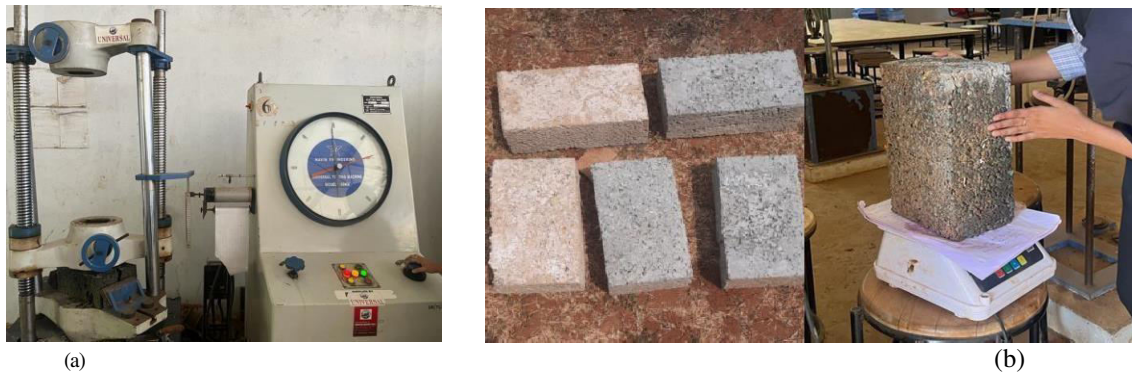
Fig.5 showing the tests of the brick (a) Compression Strength Test (b) Waterabsorption Test

Table 1 and 2 shows the preliminary test results of glass powder