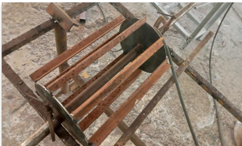
Fig. A- Main Extraction Roller

Superior quality of fiber is one which contains no pulpy matter or pigment spots or knots. They are uniform in size and are straight. For our design, clearance of 1mm, drum speed of 700rpm and feed position of 180 degree are suitable. Instead of single crushing roller, we are providing dual crushing rollers for complete removal of Pseudostem. The average force required for extraction of fiber is 17.6kgF. By providing Guide and feeding rollers.