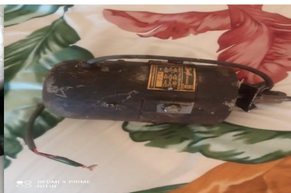
Fig. E- MOTORS