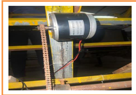
Fig.2 DC Motor