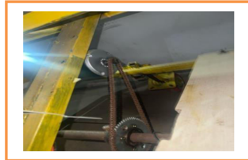
Fig.3 chain Drive