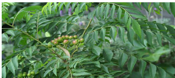
Figure 1- Murraya koenigii leaves

No one can clearly distinguish the nutraceutical and medicinal plants because the primary character of nutraceuticals is to make healthy and play a vital role in the diet as food sources [5]. On the other hand, many medicinal plants have specific medicinal value without any nutritional value and use these plants in the specific health issue.