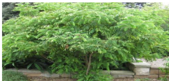
Figure 2- Murraya koenigii Plant