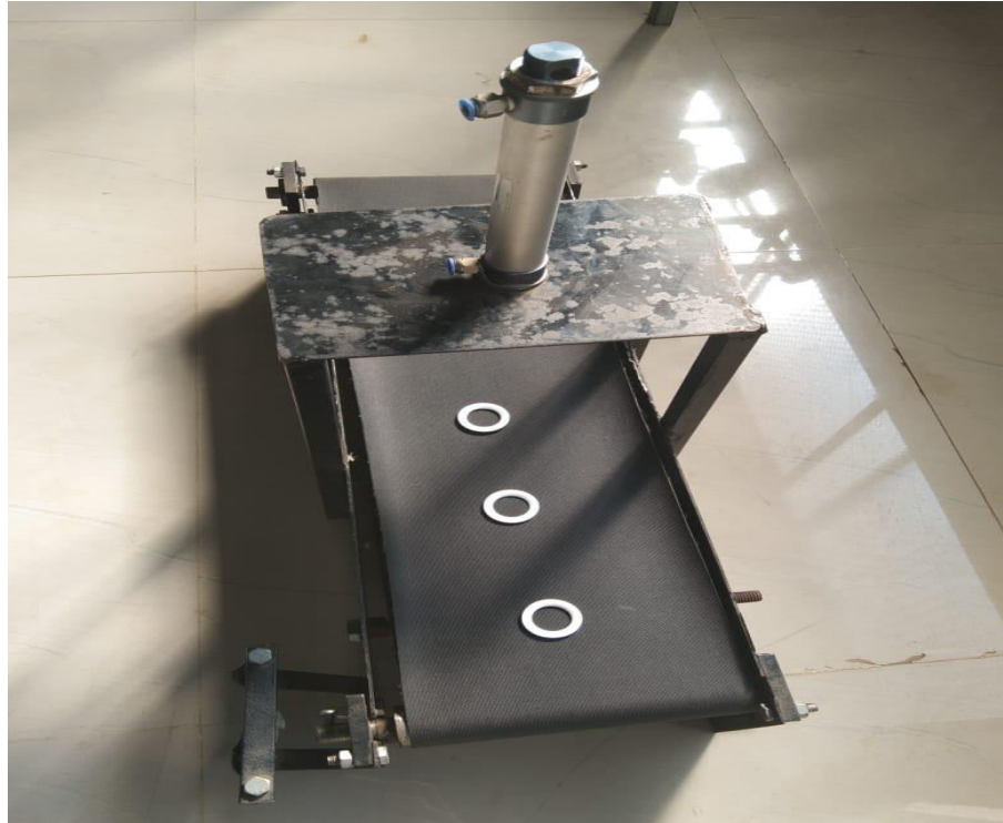
B] Model belt conveyor system