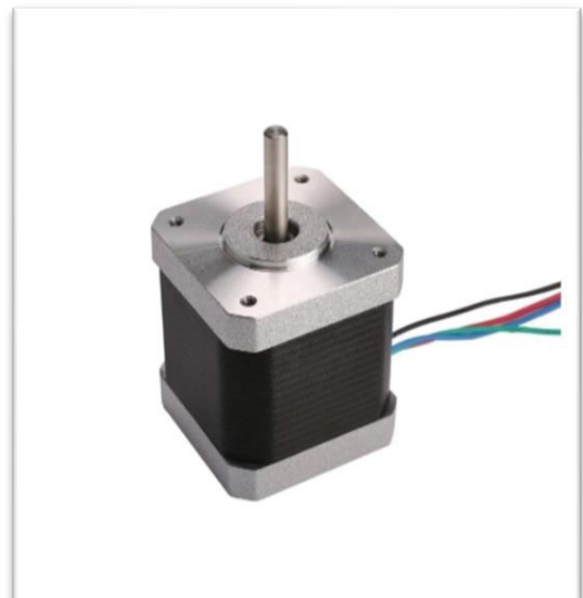
D] Dc stepper motor