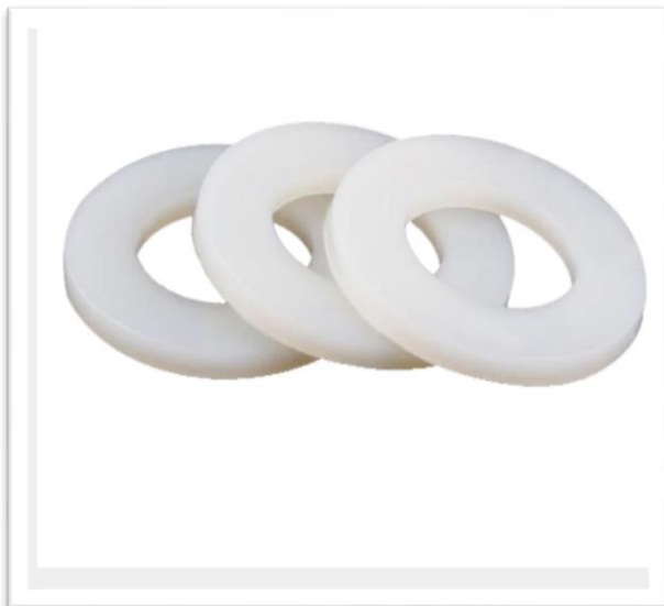
C] Plastic washer