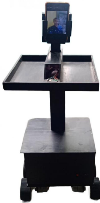
Fig 1. Virtual doctor robot Model