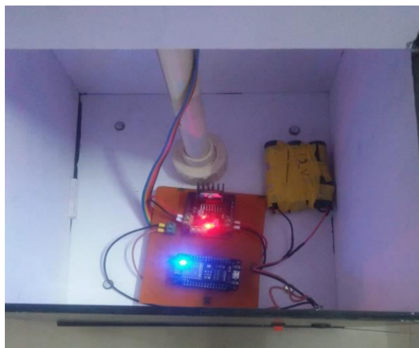
Fig 2. Inside the black box