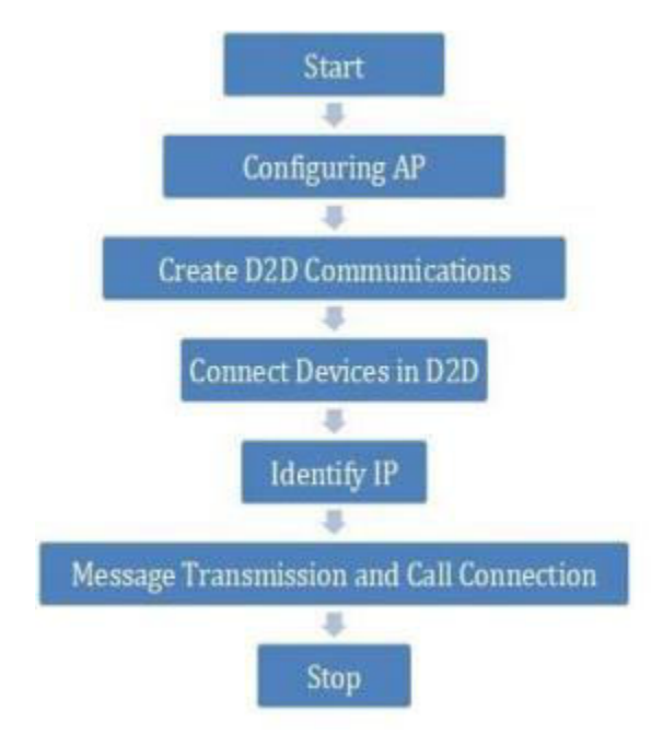
Figure-1 System Architecture