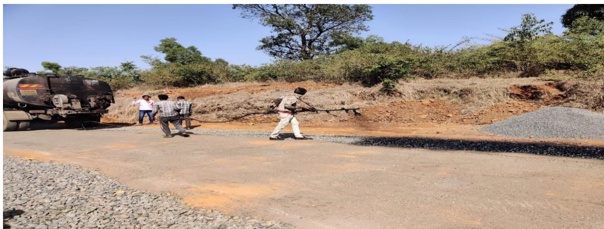
Figure No.4 –Bitumen Sprayer