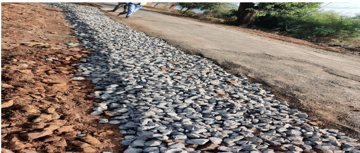
Figure No.2 Stone Aggregate Grey