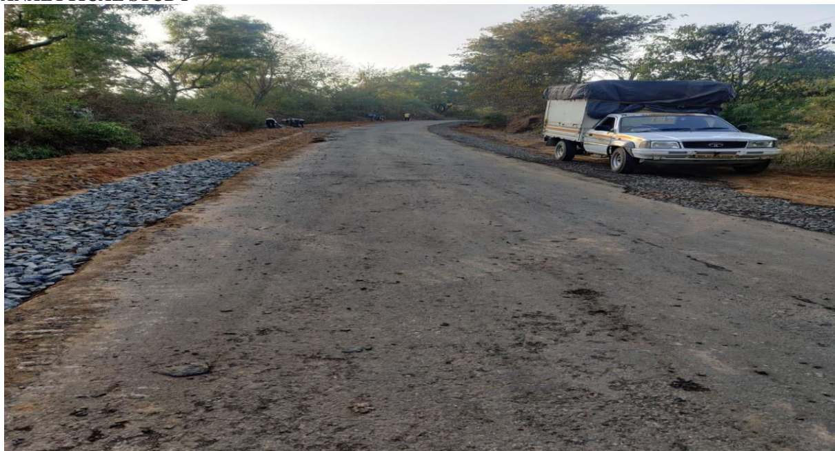
Figure No.1 Road view