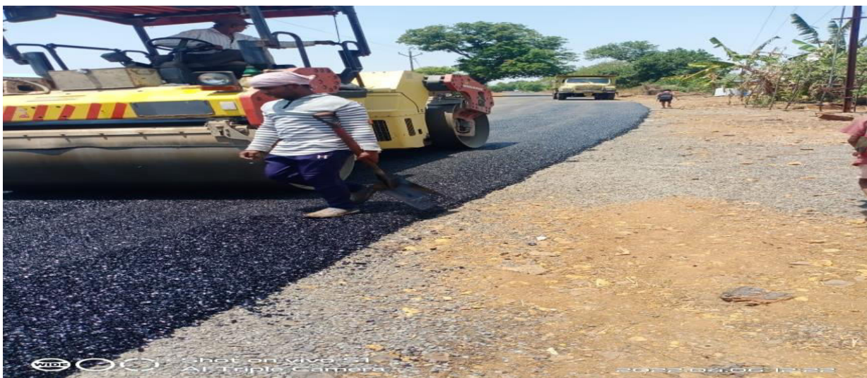
Figure No.3 Preparation and placing of Premix.