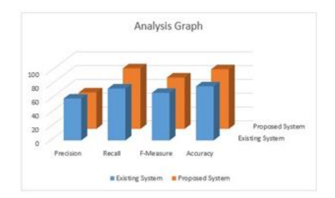
Fig. 2. CNN Classification Accuracy Graph