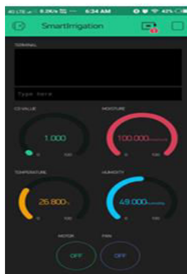
Fig 3: Mobile Application