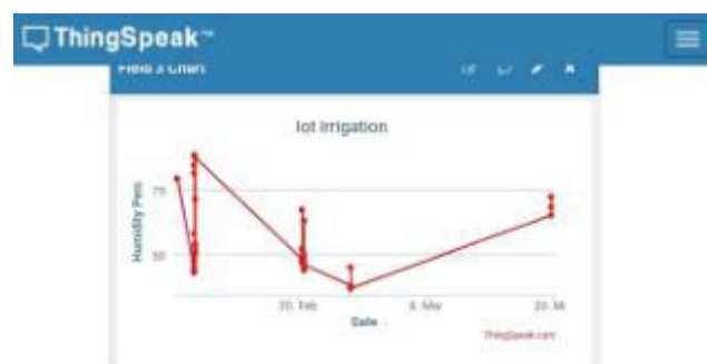
Fig 6: Field Chart 3