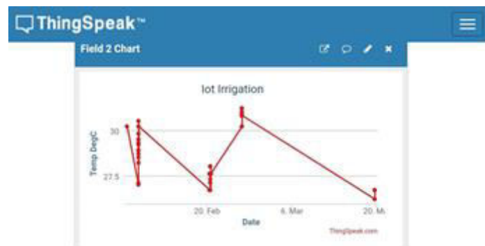
Fig 5: Field Chart 2