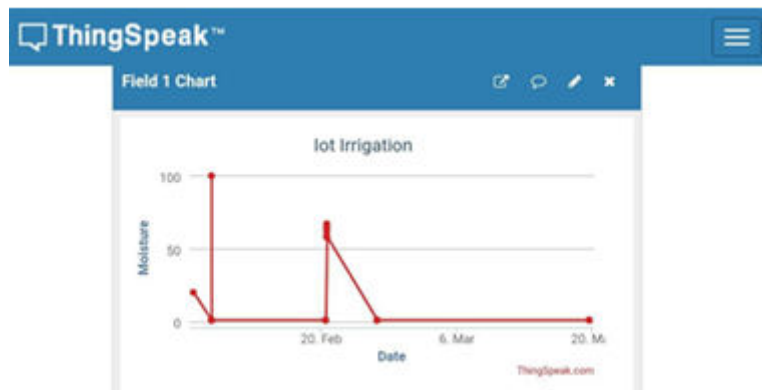
Fig 4: Field Chart 1