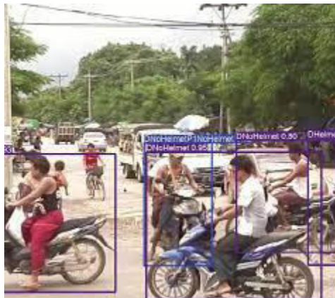
Fig 3: A Swin Transformer-Based Approach

proposes an enhanced YOLOv5m and LPRNet model-based automobile license plate identification technique. Based on an analysis of the YOLOv5m algorithm and the image features of the vehicle license plate, the algorithm is refined in three ways: the matching degree between the anchor frame and the detection target is enhanced via the K-means++ algorithm; the NMS method is refined via the DIOU loss function; and the feature map with 20 \times 20 is eliminated to decrease the number of detection layers. Without character segmentation, license plate character recognition is achieved using a lightweight LPRNet network. A license plate recognition system based on the IYOLOv5m-LPRNet model is built by combining the enhanced YOLOv5m algorithm with the LPRNet network. The authors suggested a few methods to increase license plate detection accuracy. The multidimensional clustering of label data sets using the K-means++ method can significantly shorten the time it takes the model to locate the anchor.