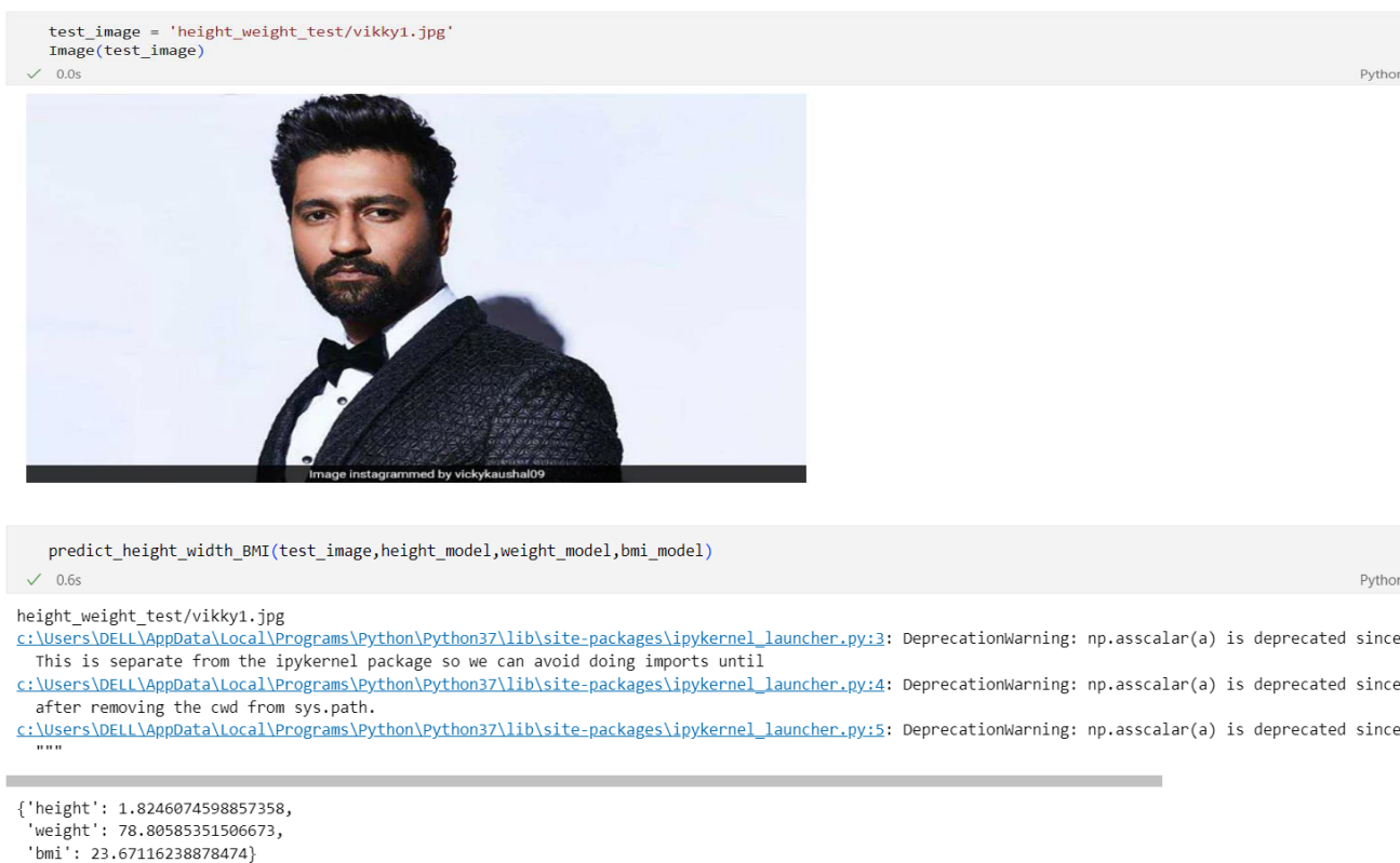
Fig-3 Sample Output-1