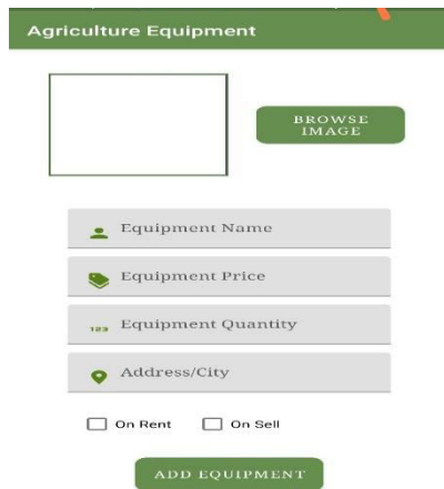
e) Add equipment page