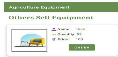
(f) Sell page