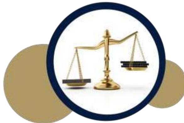
Fig. 2 Basalt fibre has less weight

Basalt Fiber is useful for the concrete because it adds strength, durability, and reduces shrinkage. Basalt Fiber is also a non-rusting alternative to steel rebar and don't corrode over time. These benefits enhance the life of the concrete and increase the effectiveness of the overall construction in any project.