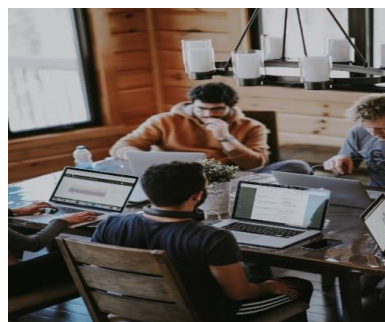
Figure 3: Research on explainable AI

Interpretability: Understanding how robots make decisions based on learned models can be challenging. This lack of transparency can hinder trust and acceptance of these systems. Research on explainable AI (XAI) is crucial for addressing this issue.