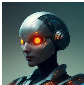
Figure 4 : Human Robot Model

Perception Algorithms: Robots need sophisticated algorithms to interpret sensory data and construct an accurate understanding of their environment. Advances in computer vision, object recognition, and scene understanding are crucial for robots to adapt their actions based on real-time perception.