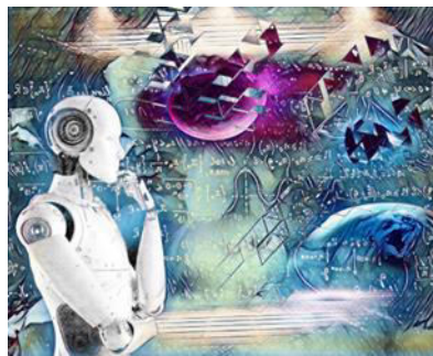
Figure 2: Robot learning

Supervised learning is a type of machine learning where the algorithm learns from labeled data. Labeled data refers to input-output pairs, where each input is associated with a corresponding output or label. The goal of supervised learning is to learn a mapping or relationship between inputs and outputs based on the provided labeled data.