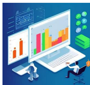
Figure 5: Data prediction through Meta Learning

Self-supervised learning is a type of learning where a model learns from the data itself without requiring external labels or annotations. Instead of relying on labeled data, self-supervised learning leverages the inherent structure or relationships within the data to create learning tasks. The model is trained to predict certain parts of the input data based on other parts, effectively creating its own labels.