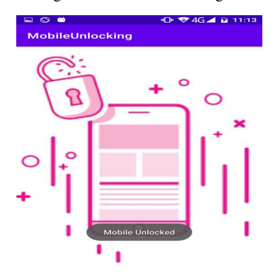
Figure 3 Unlocked Mobile UI