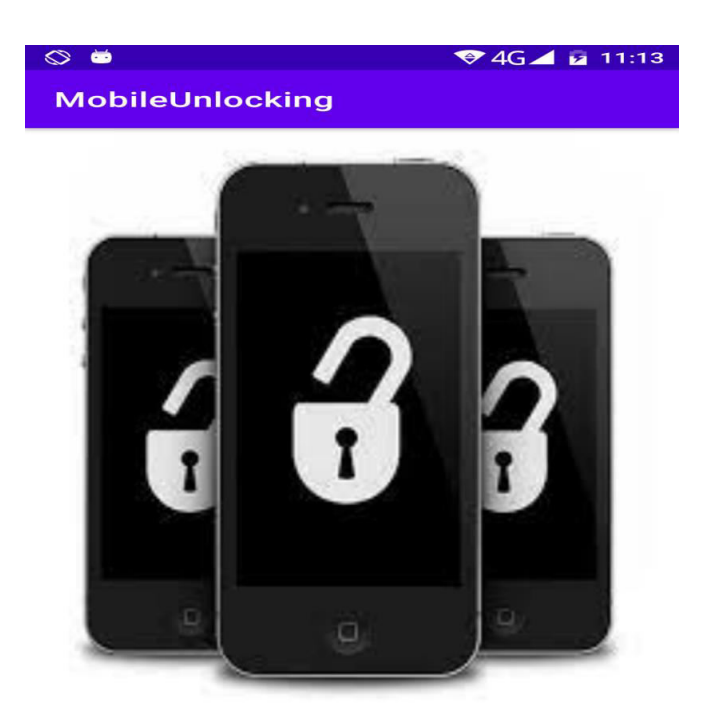
Figure 2- Mobile Unlocking Interface

The lock screen module is configured to receive an input to authenticate the user and/in response to the authenticated input, unlock the mobile device, and further comprising gesture definition module that, when the mobile device is unlocked, is configured to receive the touch gesture entered by the user that, when detected by the gesture interpretation module, causes the lock action module to execute the particular action, whereby detection of the user-defined shape securely authorizes execution of the particular action while the lock screen view is displayed at the touch screen