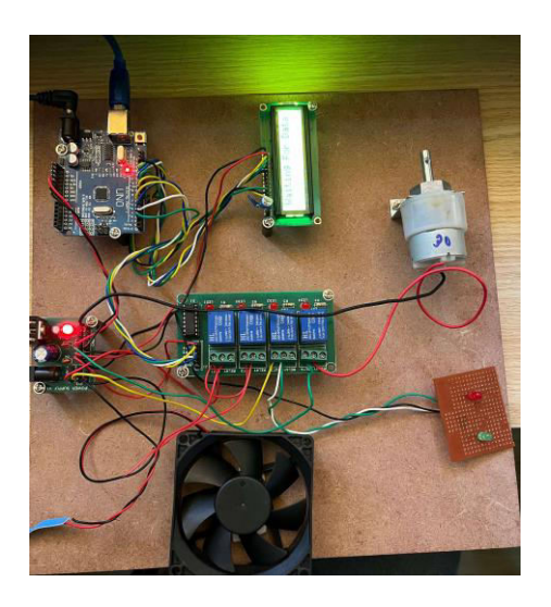
Fig 2: Result of the LED turn on