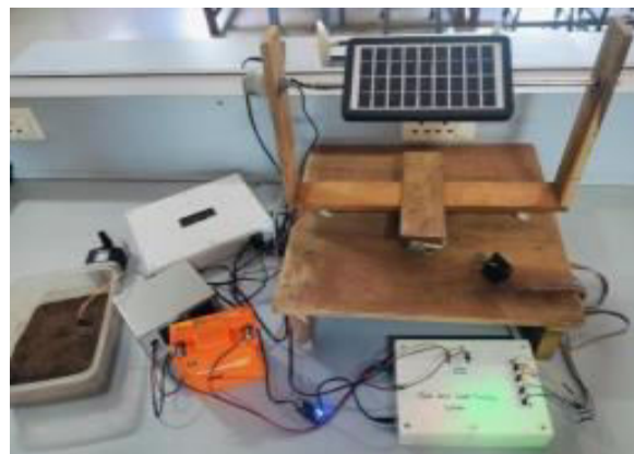
Fig. 4 Proposed System