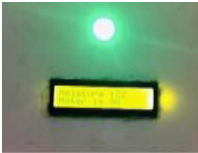
Fig.2 LCD Display

In smart irrigation Controllers can be adjusted from our phone and can help to identify farm land soil moisture status, monitor and control remotely according to user requirement and the final output of our project is as below: