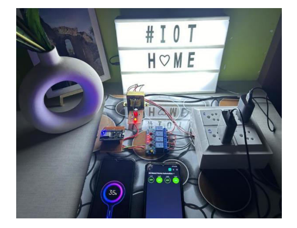
Fig c : Executed exemplar