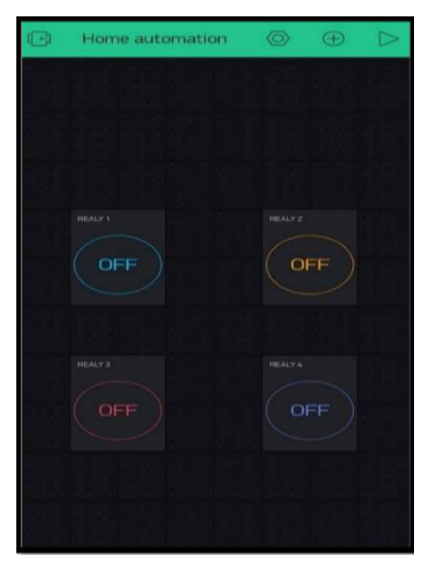
Fig b : Interface of Application