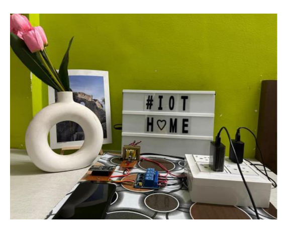
Fig a : Exemplar of System

Figures shows the result of the IOT (Wi-Fi) Based Home Automation System. Fig 'a' shows the overall exemplar of the system. Fig 'b' shows the interface of the application used to control the framework whereas Fig 'c' depicts the exemplar when executed.