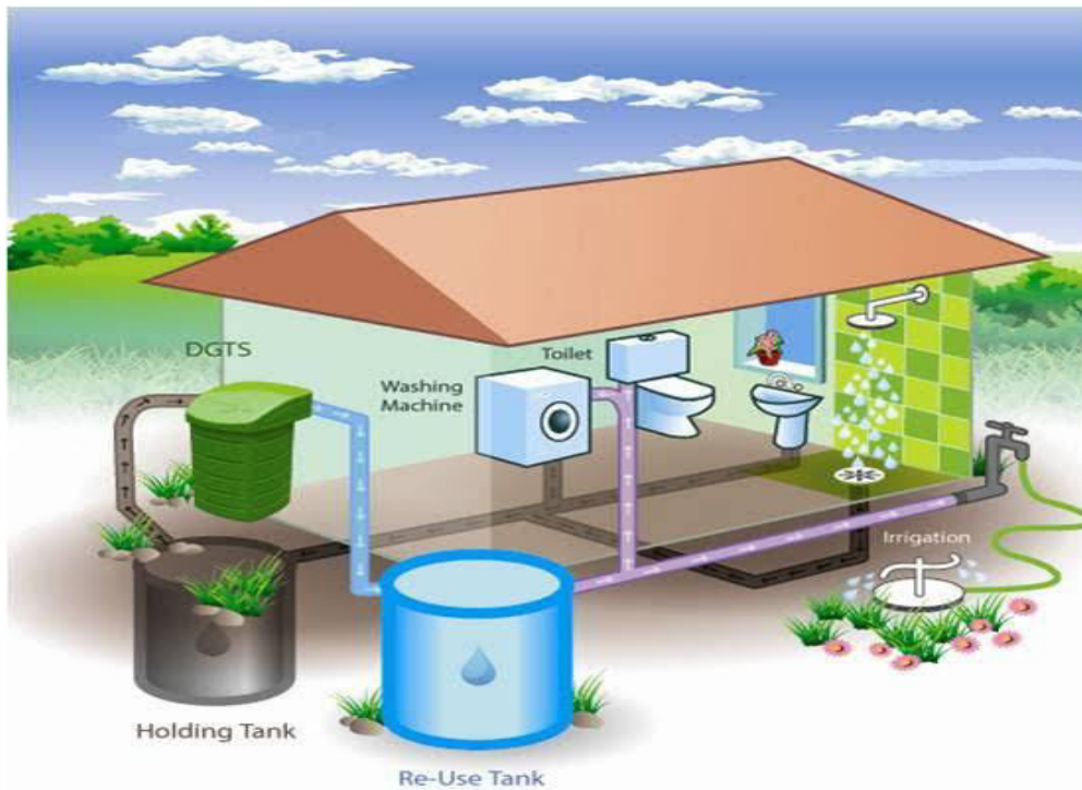
Fig. No. 1 Greywater recycling system