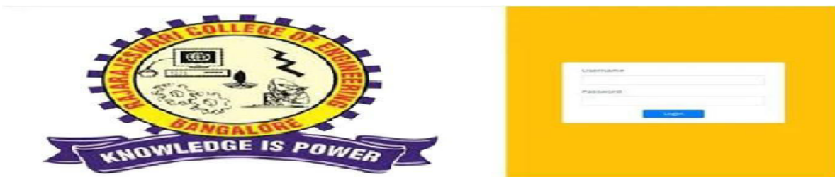
Figure 2 : Home Page

To eliminate small objects, connected component labelling is applied to the resultant image.(c) represents text detection by applying second set of criteria which eliminates all the objects whose area is less than 300 and filled area is less than 500.