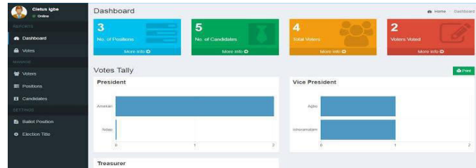
Figure 4 : Dashboard

The dashboard for a real-time polling and voting system using Django serves as a central hub for administrators. It features a navigation sidebar with links to key sections such as Dashboard, Votes, Voters, Positions, Candidates, and Settings. The main content area provides an overview of important metrics and detailed views of votes and candidate information. The logged-in user, identified as the System Administrator, can easily monitor system status and manage the voting process. Status indicators and overview widgets display real-time data, such as active voters and recent activities. A top bar may offer quick access to notifications and user settings, while the footer provides system information and developer credits. Overall, the dashboard is designed for efficient navigation and management of the voting system.