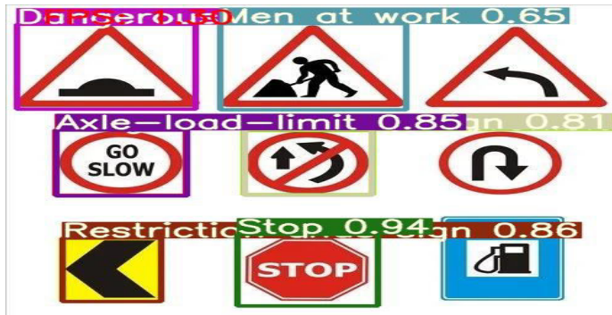
Fig 3: Signs view