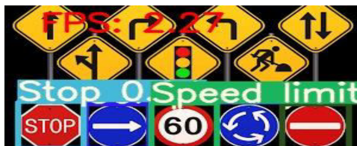
Fig 2: The output view