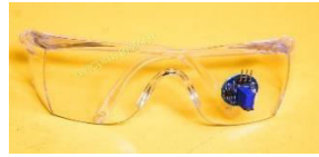
Fig1: Eye blink sensor