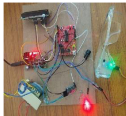
Fig: Setup of ECSS

To implement an electronic eye-controlled security system using MSP430 and Android, the process typically includes interfacing sensors such as ESP32 cam or IR sensors with the MSP430 to detect motion or presence. The MSP430 then relays this communication protocols like HC-05 Bluetooth or Wi-Fi. Upon receiving the data, the Android device initiates security actions such as sending alerts.