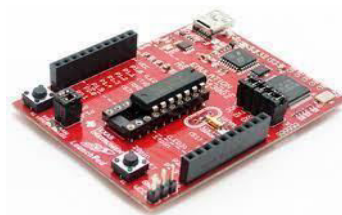
Fig5: MSP430 microcontroller

The MSP430 is a unique 16-bit microcontroller known for its special features not commonly found in others microcontroller.