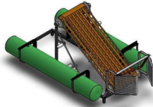
Fig-5.3. 3d modelling