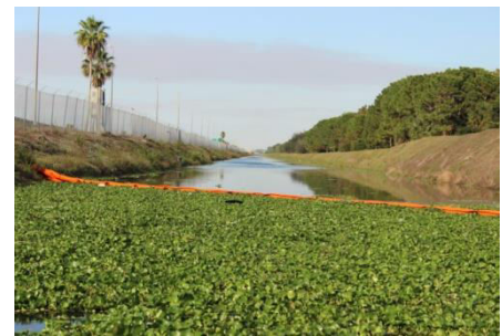
fig-5.2 vegetation in canal