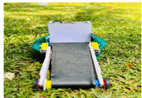
FIG-5.2 CANAL CLEANING MACHINE