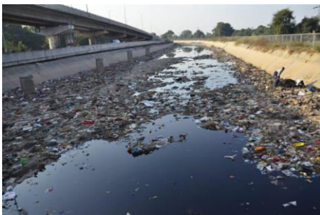
fig-5.1 floating waste in canal

Canal cleaning machine is used for cleaning of canal floating waste & vegetation, it has amphibious vehicle system due to which machine can work both water & land regardless of terrain. It collects the waste & vegetation from the canal and collected in the storage area provided on both sides which helps machine to gain more stability due to floating of light weight waste in it. First of all the machine is lowered into the water, its remote control and navigation are checked whether it is working or not, the machine is switched on and the floating waste and water leaves in the canal are started to be removed. After the storage capacity is full, the waste is collected from the machine and it is collected and disposed of.