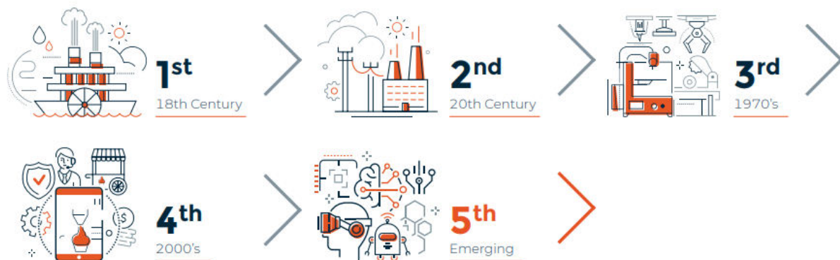
Fig (2) Industry Waves.

Industry Waves : The essential Industry 4.0 approach involves the deployment of IoT technologies in manufacturing facilities to collect and analyze data using cloud computing – then, using big data insights to power more efficient value chains. Effectively, Industry 4.0 is about automating processes and incorporating edge computing (both sensors and actuators) – the pure application of technology to create smart factories, leverage digital twins, and realize hyper-optimized production lines and smart products