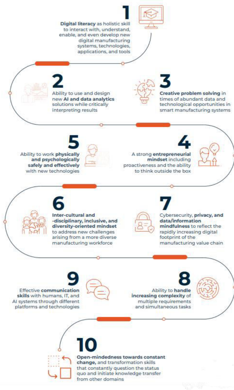
Fig (4) Positioning For the Future of Manufacturing