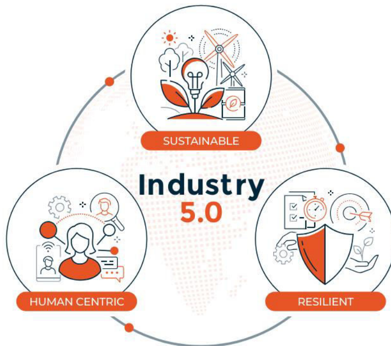
Fig (1) Industrial Revolution

The European Union has merged these perspectives to create a manifesto for “purpose-driven” technology adoption: Industry 5.0. This vision emphasizes a triple-bottom-line of economic, environmental, and societal impact, bringing ESG (Environment, Social and Governance) perspective and balance to what have often been technology-led and economic-driven choices. The core principles of Industry 5.0 are that the industry is Human-centric, Sustainable,