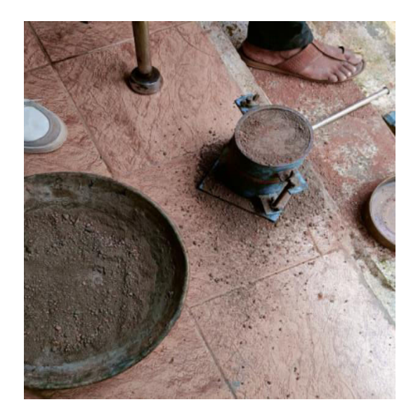
Fig 3: Stabilization/solidification

Solidification is typically a process that involves a mixing of waste with binders to reduce the volume of contaminant leachability by means of physical and chemical characteristics to convert waste in the environment that goes to landfill or others possibly channels. Stabilization is attempts to reduce the solubility or chemical reactivity of