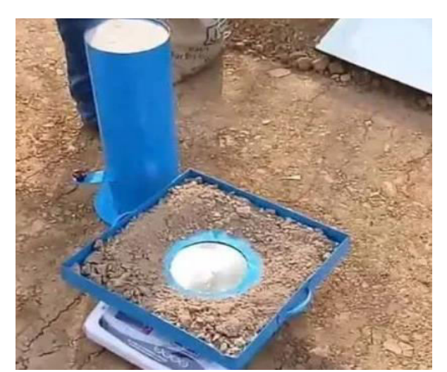
Fig 1: Soil replacement

The system of soil replacement uses clean soil to completely or partially replace polluted metal soil. It is also referred to as the 'dig and haul' process. The key aim is to reduce the concentration of pollutants and increase the soil's natural potential, thus remediating the soil. This technique is very laborious, costly and only appropriate for smaller areas that are heavily polluted. Again, it is split into three types, namely soil substitution, soil spading and soil importing. Soil substitution is the process in which the polluted soil is removed and fresh soil is kept in its place. This approach is only