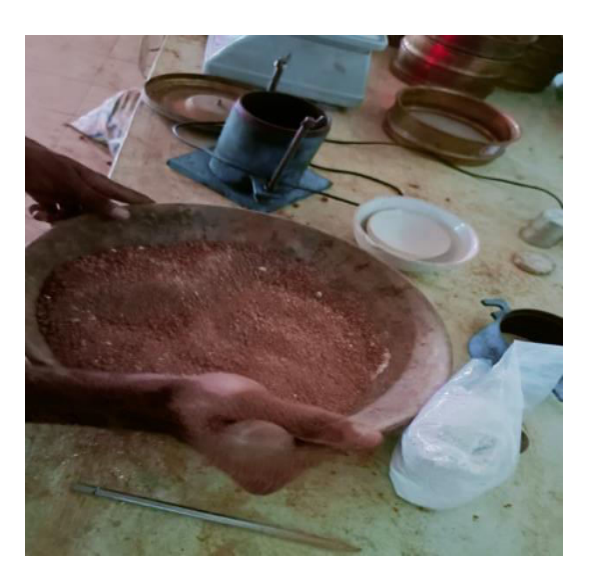
Fig 2: Chemical fixation

The technique of chemical fixation applies reagents or chemicals to the polluted soil that interacts with heavy metals and forms low toxic substances that are insoluble or hardly mobile. Such solid types of heavy metals could then not migrate to water, plants or any other environmental media, thereby completing the remediation process. This method is effective for soil with low contaminant concentrations. Conditioning agents used in the method include clay, metallic oxides and biomaterials, but these agents can affect the soil structure to some degree and can also have an adverse impact on the soil microbes.