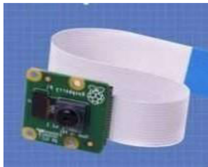
Fig.3: Raspberry Pi Camera

Raspberry Pi Camera: Raspberry Pi cameras come in various resolutions, ranging from lower resolutions (e.g., 5 MP) to higher resolutions (e.g., 12 MP or more). Higher resolution allows for more detailed images but may require more storage space, animations, etc. Higher frame rates result in more data being generated. Common frame rates range from 30 to 60 frames per second.