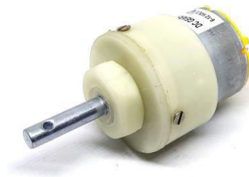
Fig1: DC Motor

A DC motor with a speed of 30 RPM (Revolutions Per Minute) means that the motor shaft completes one full rotation every 2 seconds. This speed is relatively slow and is suitable for applications requiring precise control or low-speed operations, such as robotics, conveyor belts, or small-scale machinery. The RPM value indicates the rotational speed of the motor and can be adjusted using voltage or PWM (Pulse Width Modulation) signals. By controlling the input voltage or duty cycle of the PWM signal, the speed of the motor can be varied to meet specific requirements. The 30 RPM DC motor offers a balance between torque and speed for various applications.