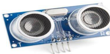
Fig4: ultrasonic Sensor

Ultrasonic Sensor: The HC-SR04 ultrasonic sensor is a popular module for measuring distance using ultrasonic waves. It features a range of 2cm to 400cm, with high accuracy and reliability. It consists of an ultrasonic transmitter and receiver, and is widely used in robotics, IoT projects, and automation for obstacle detection and proximity sensing.