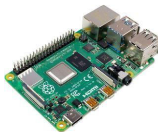
Fig5: Raspberry Pi 4 model B

Raspberry Pi 4 model B : The Raspberry Pi 4 Model B is a versatile single-board computer with a quad-core ARM Cortex-A72 processor, up to 8GB of RAM, dual 4K HDMI outputs, Gigabit Ethernet, USB 3.0 ports, and support for various operating systems. It is ideal for DIY projects, programming, media streaming, and more.