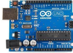
Fig.2: Arduino uno

Arduino Uno is accessible to beginners and advanced users alike, making it a valuable tool for learning electronics, programming, and creating interactive projects.