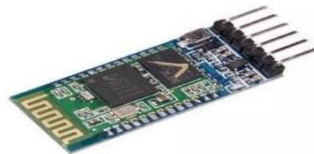
Fig 8: Bluetooth module

Bluetooth module: A Bluetooth module is a small electronic device that allows devices to communicate wirelessly using Bluetooth technology. It transmits and receives data over short distances, enabling connections for audio, data transfer, and device control