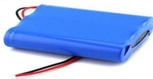
Fig 9: Lithium ion battery

Lithium ion battery: A lithium-ion battery is a rechargeable battery type that uses lithium ions to move between the positive and negative electrodes. Known for their high energy density, they power devices like smartphones, laptops, and even electric vehicles.