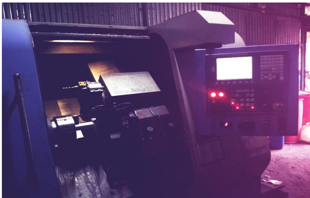
Figure 1. Turning set-up

Experiments are carried on Lakshmi Machine Works (LMW), Model- SMARTURN. Experimental set-up is shown in figure 1. EN-19 (length 105 mm, diameter 78 mm) was used as work piece material and TNMG 160408 MC; Grade-TT5100 insert as cutting tool.