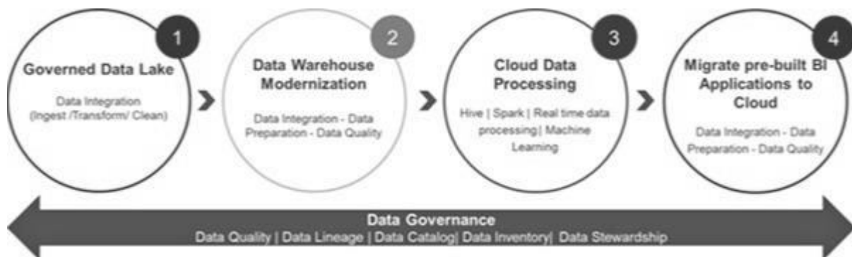
Fig 2: Talend Data Integration