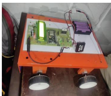
VEHICLE SPEED CONTROLLER BY USING RFID

The power supply system, usually consisting of batteries, is integrated into the vehicle and connected to the electronics.