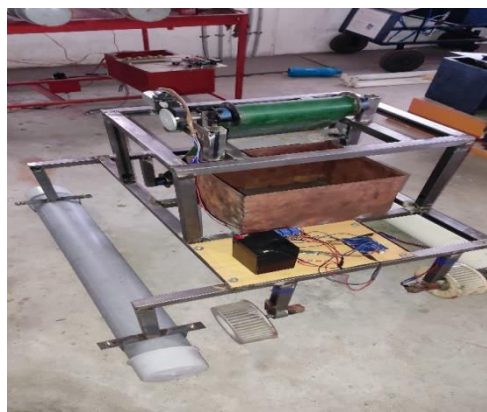
Fig: Final Assembly of the Project

Finally, the system is assembled and tested to ensure that all components are properly aligned and that it operates smoothly. Calibration tests are used to fine-tune belt speed, motor power, and Bluetooth responsiveness. The entire system is then tested in a controlled water body using simulated oil spills to determine its efficiency, stability, and manoeuvrability.