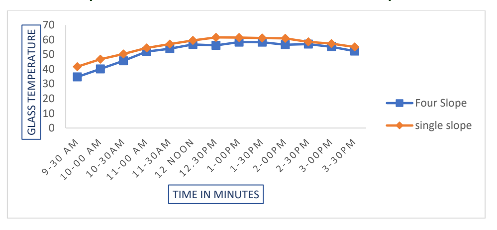
Fig. 6 : Variation in Glass Plate Temperature Over Time