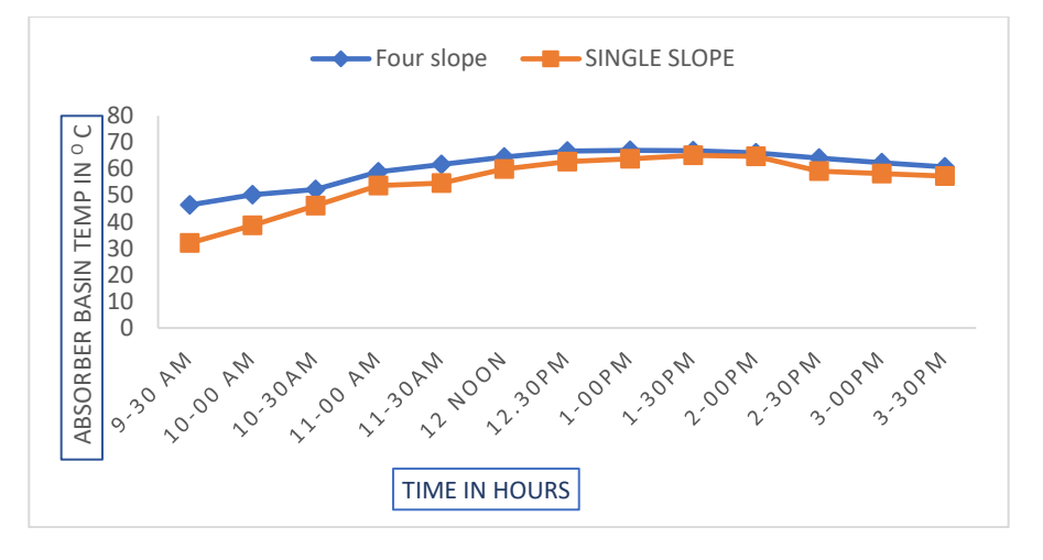
Fig. 4 Variation in Absorber Basin Temperature Over Time