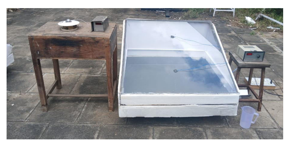
Fig. 1 SINGLE SLOPE SOLAR STILL

The four sloped solar still was designed to enhance the efficiency of water distillation through its innovative geometry. This setup features two sloped surfaces that create a dual condensation area, maximizing the collection of distilled water. The dimensions of the double slope solar still are 73cm in length, 69cm in breadth, and 41cm in height, while maintaining the same 45-degree angle for optimal solar exposure.