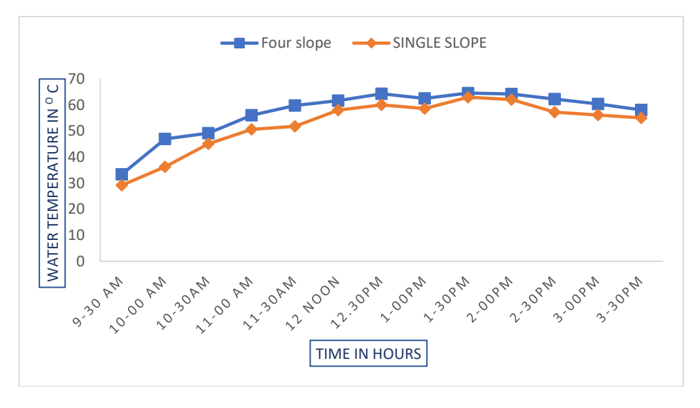
Fig. 5 : Variation in Water Temperature

Figure: 5 shows that the variation in water temperature in the attempted solar still configurations. While single slope stills reach a temperature of around 60°C, the Four slope solar stills exhibit better water temperature due to their enhanced condensation surface area. This phenomenon is consistent with the studies of Harisivasankaran et al [18].