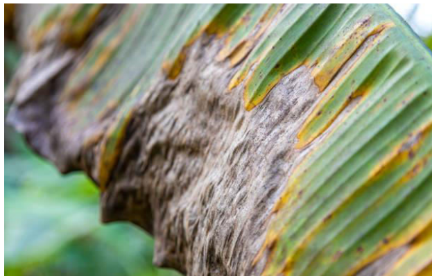
Fig 1. Banana Leaf Disease