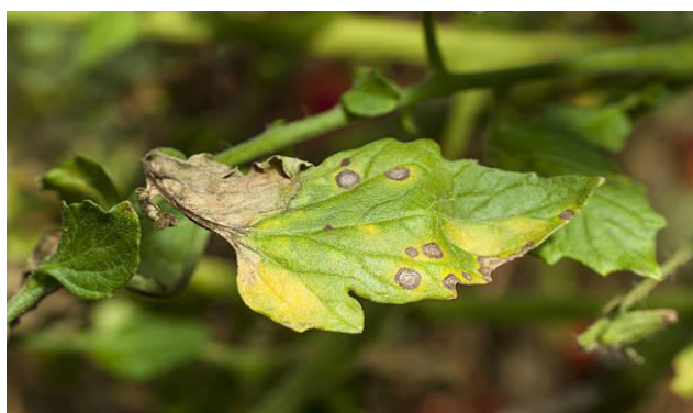
Fig 2. Tomato Leaf Disease