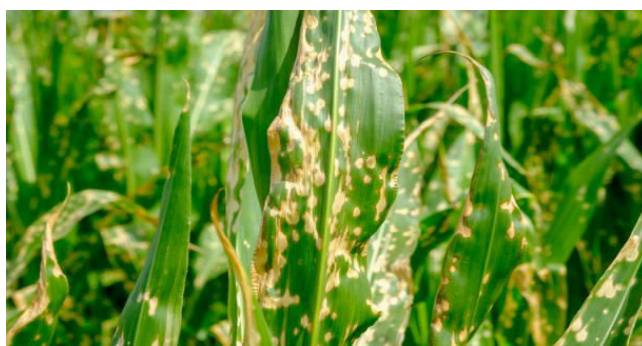
Fig 3. Corn Leaf Disease