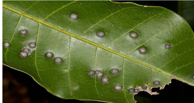
Fig 4. Mango Leaf Disease

These images demonstrate the effectiveness of the GreenScan system in detecting crop deficiencies. By providing accurate visual insights, the system aids in early intervention, ensuring better crop health and yield.