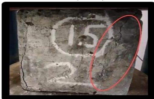
BEFORE (1 DAY)