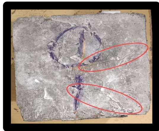
AFTER (6 DAY)