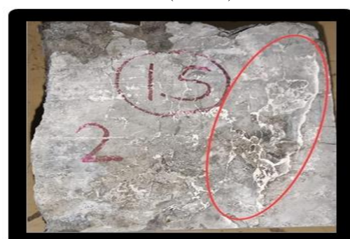
AFTER (6 DAY)