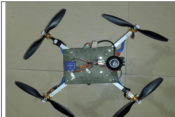
Fig.3.1 Image of Drone Model