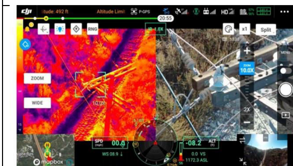
Fig. 3.3 Thermal Image Captured by Drone