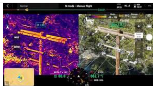
Fig. 3.4 Image Captured by Drone