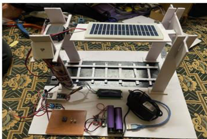
Fig 6.1 Model

For widespread global implementation, well-defined policy recommendations are vital. Governments should introduce incentive schemes, like tax benefits and feed-in tariffs, to stimulate private sector investment in solar railway projects. Furthermore, simplified regulatory procedures and standardized grid interconnection protocols would accelerate project development and deployment. International partnerships and knowledge exchange programs are also essential for sharing best practices and promoting a global shift towards sustainable railway energy solutions. All these can be seen in the fig 6.1.