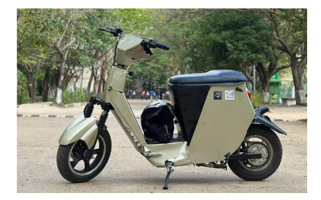
Fig 4.1 VoltRanger

Testing of the VoltRanger off-road electric vehicle involved thorough assessments in different terrains to determine its efficiency alongside performance and durability and safety aspects. The testing results proved the vehicle delivered high torque which produced smooth operation on steep hills as well as rocky terrain and mud paths. The power transmission functionality of the BLDC motor and sprocket chain drive system enabled efficient power transfer while simultaneously guaranteeing stability during operation. The 48V battery system showed stable power delivery which