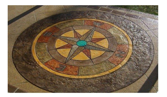
Figure 1.1- Sealing of Stamped Concrete

Stamped concrete is an innovative and aesthetically appealing flooring solution, commonly used in patios, car porches, driveways, and sidewalks. It not only enhances the visual appeal of surfaces but also provides strength and durability, making it a cost-effective alternative to expensive materials like granite and interlocking blocks. Often referred to as imprinted or textured concrete, stamped concrete can be finished to resemble materials such as slate, flagstone, brick, tile, or even wood, depending on the technique and skill applied. This makes it a popular choice for beautifying pool decks, courtyards, and residential entrances, especially for outdoor applications.