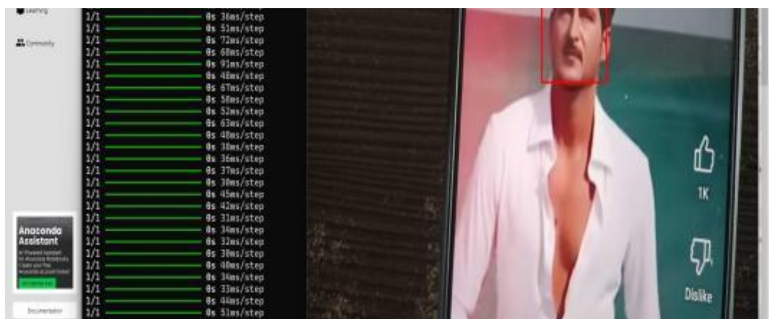
Fig.2.FAKE VIDEO ANNALYSATION