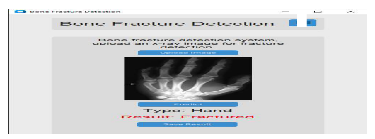
Figure -2:Hand X-ray Classification Result Indicating a Fractured Bone

The system successfully analyzed the uploaded X-ray image. It detected a hand and identified the condition as Fractured, providing a clear result for diagnosis and further medical action.