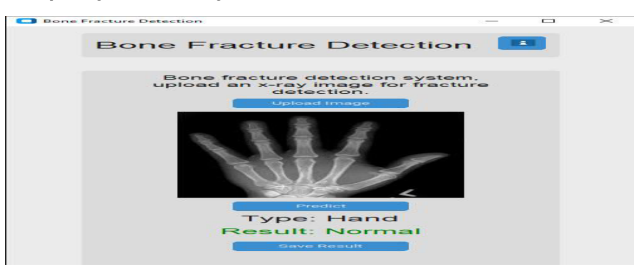
Figure -3: Hand X-ray Classification Result Indicating a Normal Bone

The system successfully analyzed the uploaded X-ray image. It detected a hand and identified the condition as Fractured, providing a clear result for diagnosis and further medical action.