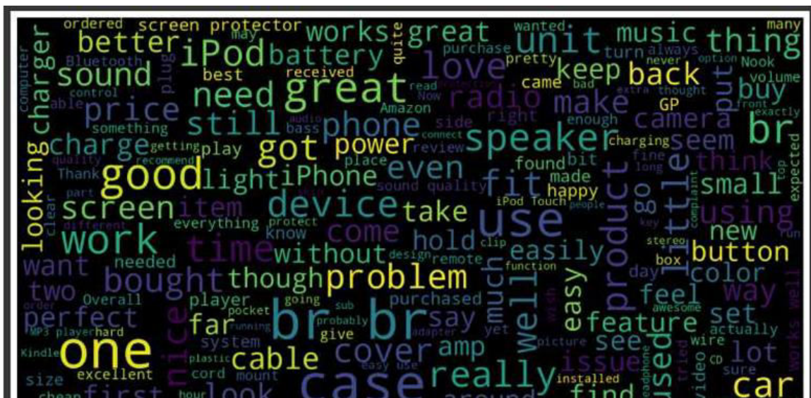
Fig 2: Word Cloud of Positive Amazon Product Reviews

The dataset is cleaned by removing duplicates, handling missing values, and preprocessing the text with tokenization, stopwords removal, and lemmatization. Reviews with 1–3 stars are labeled as negative (0), and 4–5 stars as positive (1), simplifying the task to binary classification. The data is then vectorized using TF-IDF for numerical modeling. Word clouds are generated to visualize frequently occurring terms, giving insight into common themes. The dataset is split into training and test sets for model evaluation.