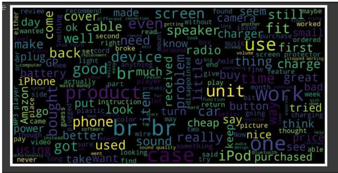
Fig 1: Word Cloud of Negative Amazon Product Reviews

Python, an open-source programming language, serves as the backbone of this project due to its extensive library support and ease of implementation. TensorFlow is used to build and train LSTM (Long Short-Term Memory) networks, which are known for their ability to handle sequential data like text. Alongside these, NLP libraries such as NLTK and SpaCy are employed for preprocessing tasks like tokenization, lemmatization, and stopwords removal. The model is further optimized with word embeddings (e.g., GloVe), enabling it to capture semantic relationships and subtle contextual meanings in the text.