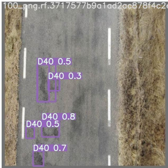
FIGURE 15. Validation YOLOv7.