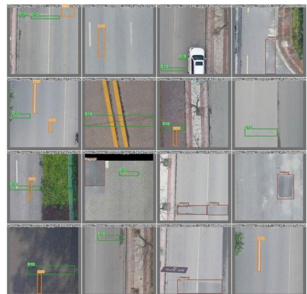
FIGURE 17. Validation YOLOv7X-W6.

The results show that YOLOv4 performed poorly in precision and detection speed, while YOLOv5 and YOLOv7 performed significantly better. Specifically, YOLOv7 stood out for its high accuracy and fast detection time. The table also includes information on the number of images used for testing, precision, recall, mean average precision (mAP), and inference time for each model.