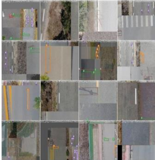
FIGURE 1. YOLOv7's default parameters on augmented images, showcasing the potential for image distortion and inconsistencies.