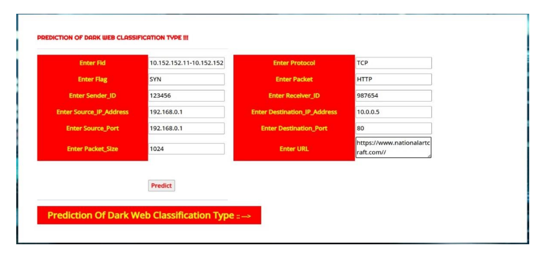
Figure 6. Entering of web details for prediction