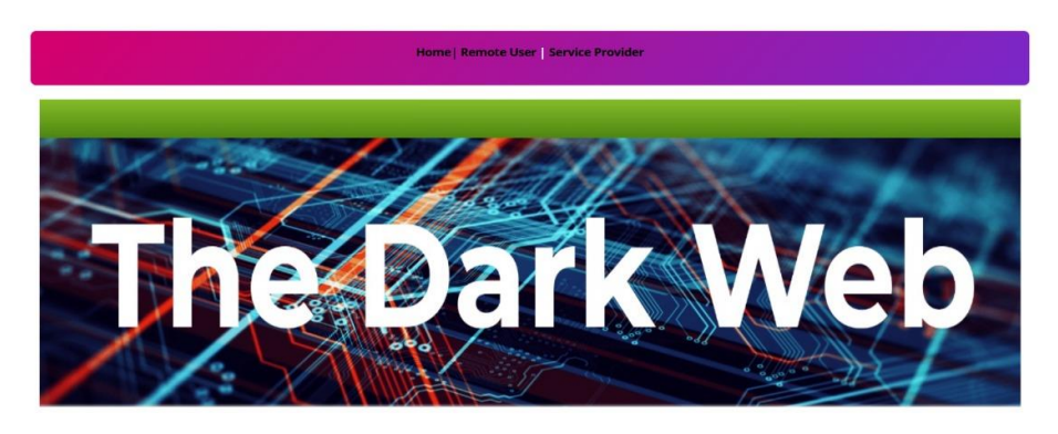
Figure 5. Dark Web page

Dark Side of the Web: Dark Web Classification Based on TextCNN and Topic Modeling Weight