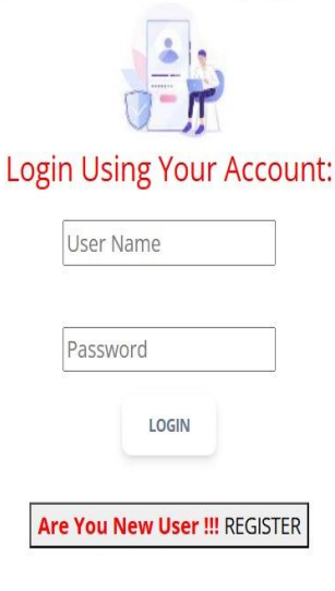
Figure 3. Input login interface

Dark web, dark web analysis, text classification, topic modeling, model explanation..